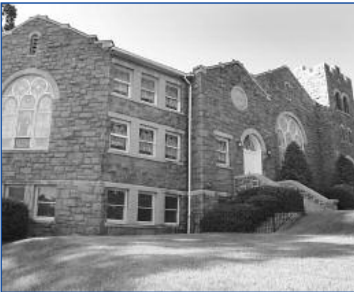
Calvary United Methodist Church in Mt. Airy